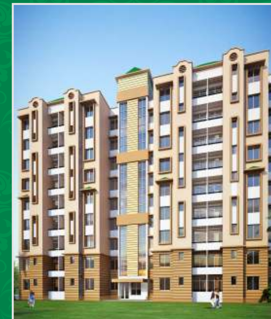
2 BHK TOWER VIEW