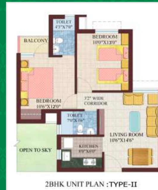
2 BHK Unit Plan