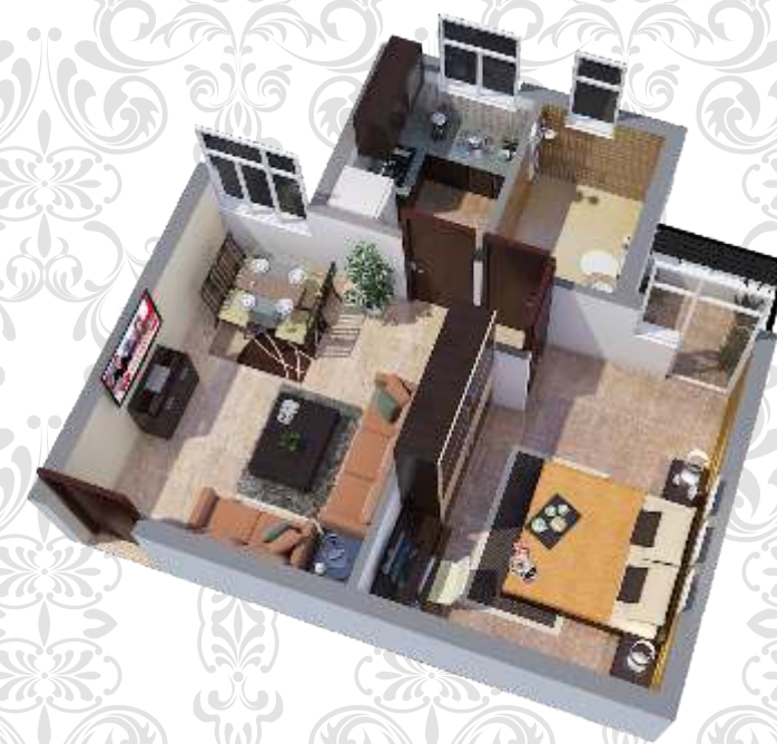
1 BHK 3D VIEW