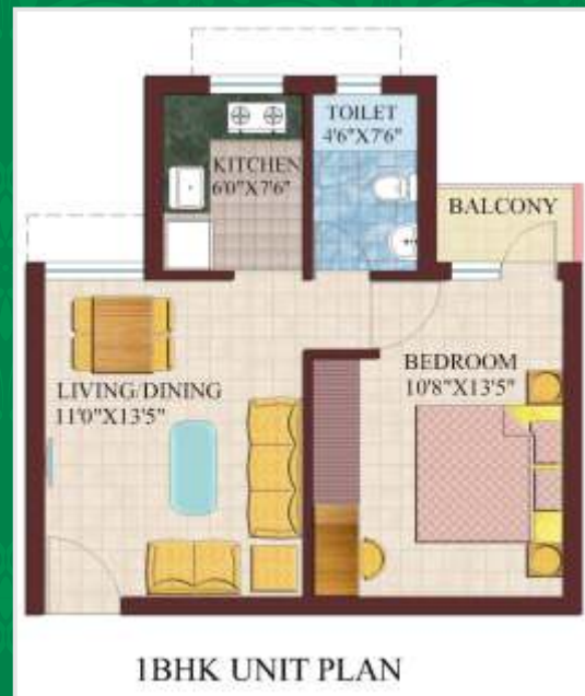
1 BHK Unit Plan