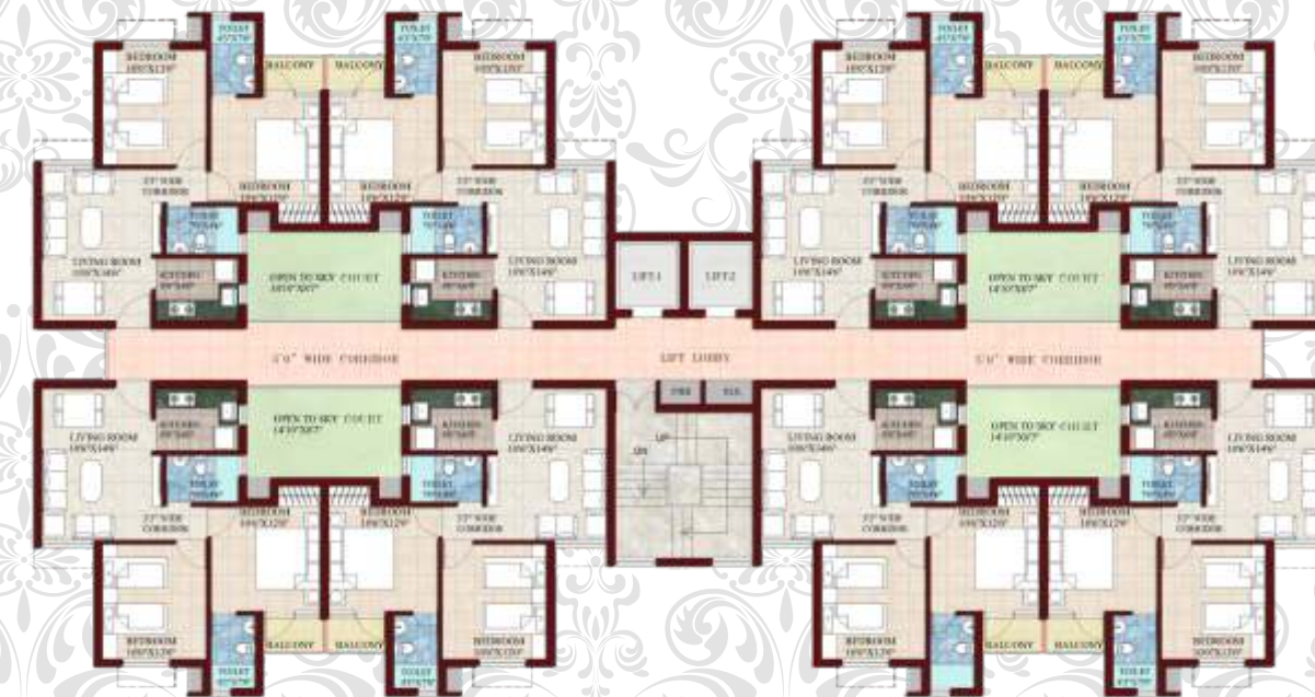
2 BHK Building Typical Floor Plan