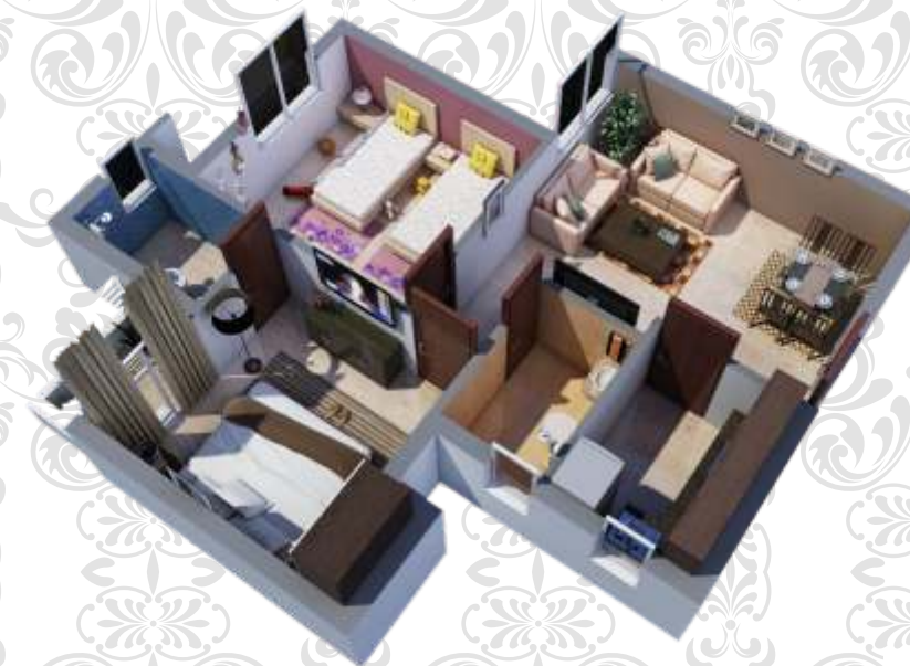
2 BHK 3D VIEW