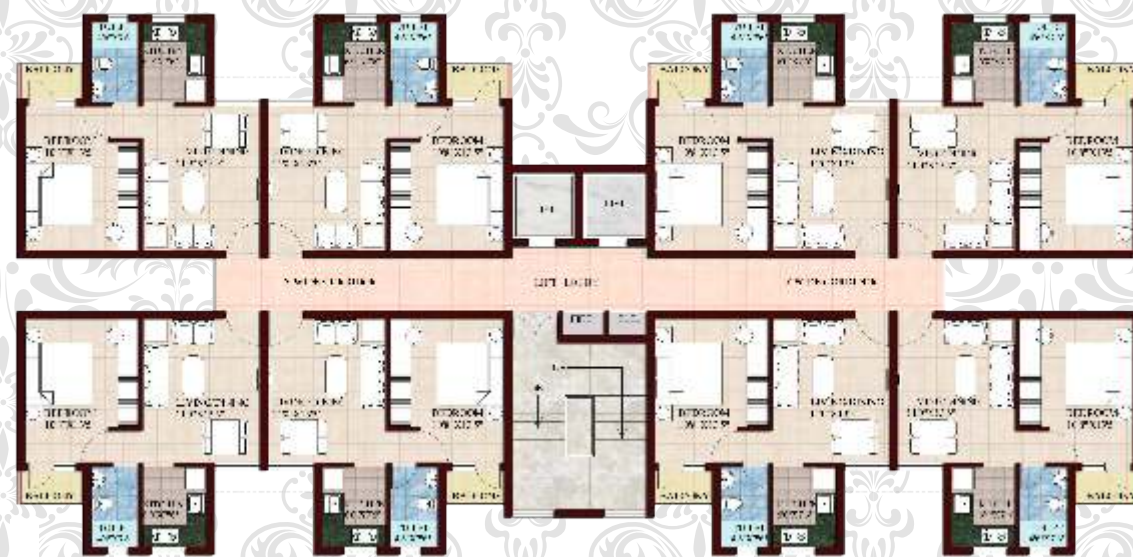
1 BHK Building Typical Floor Plan