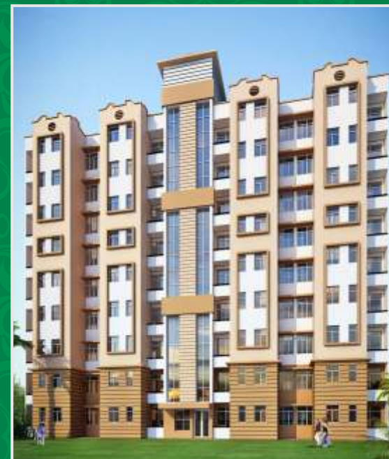
1 BHK TOWER VIEW